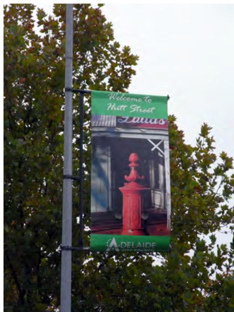
Iconic New Banners down Hutt Street

RSVP to Andrew Black by 15 April, 2010 e: andrew.black@arblack.com.au t: 08 8333 1131