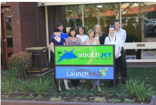
Seen here: some of the YouthJET team, gathered out front of their office located at 151 Hutt Street.